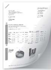
Stapling and Hole Punching