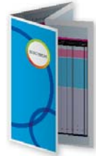
Double parallel Fold