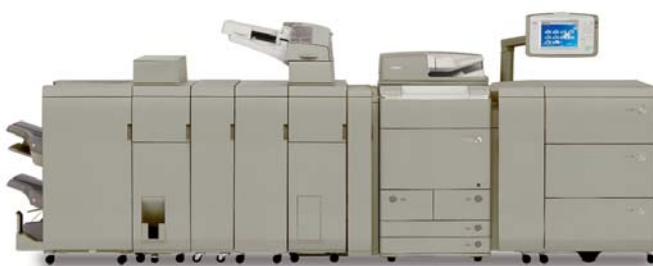
Colour imageRUNNER ADVANCE C9000 PRO Series

Whatever the scope of each production project, the imageRUNNER ADVANCE Light Production range deliver quality levels that set them apart. Incorporating a wealth of image quality know-how, every job is produced with vibrant, consistent colours or the crispest black and white text and smoothest half-tones. Diverse media handling capabilities and high-end finishing options – such as booklet making, professional punching and advanced folding capabilities – ensure prints exceed every expectation.