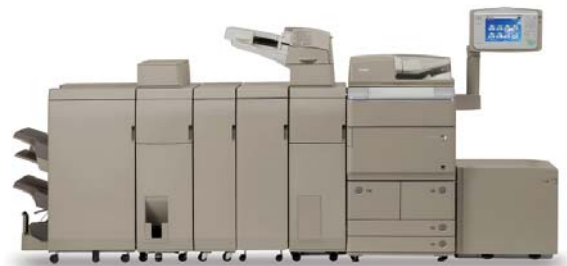
Black and white imageRUNNER ADVANCE 8000 PRO Series