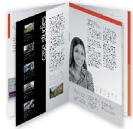
Saddle Stitching and Trimming